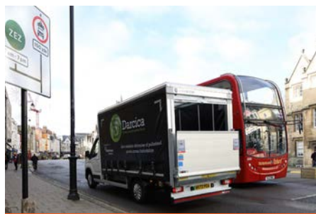
Darcica can offer zero-emission deliveries

The co-branded 3.5T electric truck - a Maxus Luton edeliver 9 with a 900kg tail-lift - is the first EV in Oxfordshire to deliver pallets. The family-run business is a frontrunner in electric vehicles, having already replaced its diesel vans with electric vans and depot use of electric forklift trucks. The new vehicle 'Bobby' is the pride of its fleet.