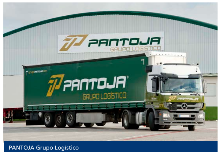
PANTOJA Grupo Logístico