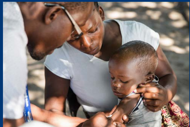
Palletways Iberia has teamed up with Gavi to provide children in East African countries with access to medicines to treat pneumonia

Gregorio concluded: "We are extremely proud to support this life-saving initiative - we are more than a palletised freight network, we're socially committed and we'll continue to support causes such as these to help those in need."