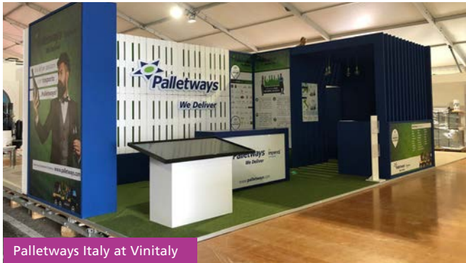
Palletways Italy at Vinitaly

Once again Palletways Italy will be a major player during the country's spring trade fair season when it attends two main industry events dedicated to the wine and home and garden sectors which are key areas for the network's business.