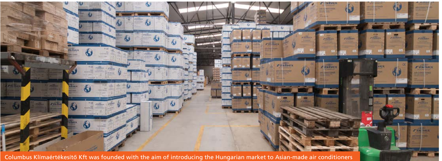
Columbus Klímaértékesítő Kft was founded with the aim of introducing the Hungarian market to Asian-made air conditioners

"I would have no hesitation in recommending TLS Express and Palletways to companies who are looking for a reliable, flexible and quality logistics partner to deliver high volumes of palletised freight nationwide."