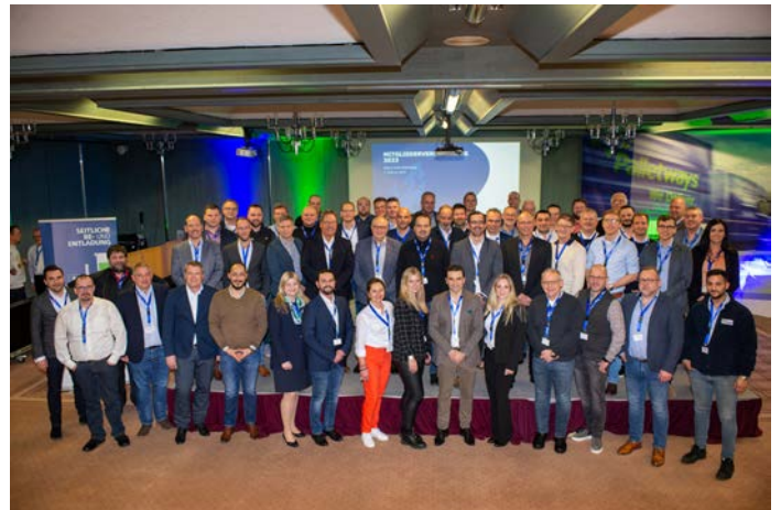
Palletways Germany invited Managing Directors from its network partners to a members' meeting