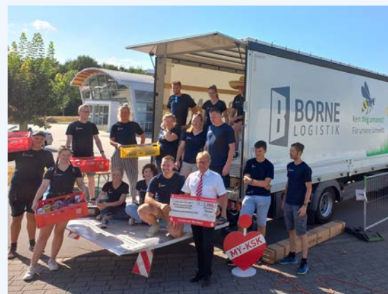
Borne Logistik & Spedition will deliver equipment to the event