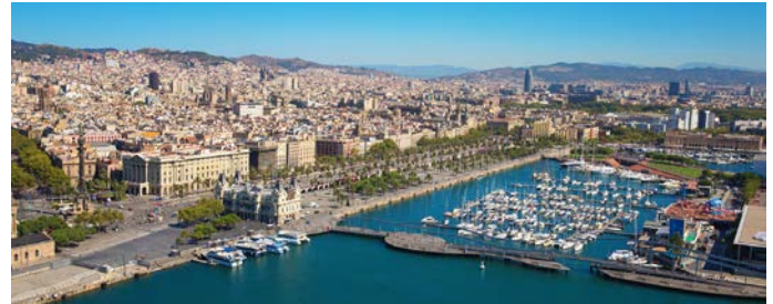
Palletways has invested in a new eco-friendly hub in Barcelona, pictured

The launch of the new operation in Barcelona takes the number of hubs in the Palletways Iberia network to four across Spain and Portugal.