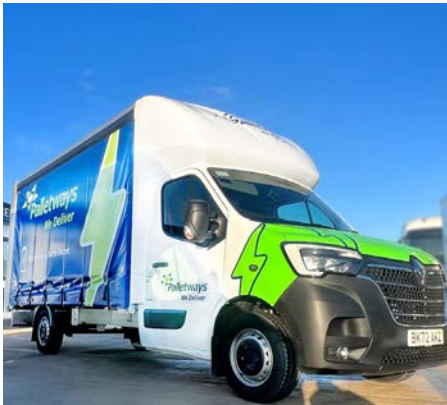
Palletways London first to benefit

Palletways has a huge fleet across the UK and the network is embarking on a roll-out programme of electric vehicles (EVs) across its owned depots for urban collection and deliveries of palletised freight.